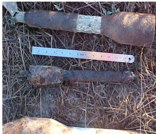
Inert 3.5 and 2.36 inch rockets recovered from site.