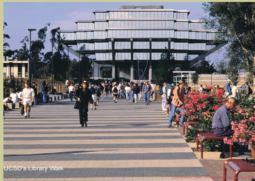
Information in this brochure was provided by the U.S. Army Corps of Engineers and UCSD image files.

UCSD Geisel Library 9500 Gilman Drive La Jolla, CA 92093-0175