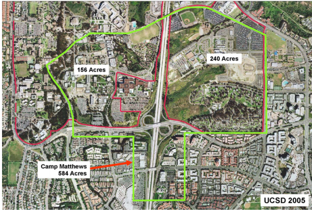
Camp Matthews FUDS area, approximately 400 acres, overlaid on an aerial map of UCSD in 2005.