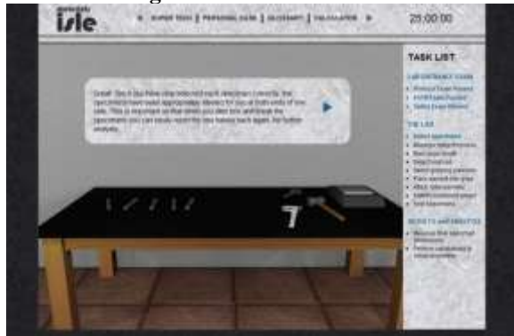
Figure 1 The Samples on lab table with Task List for this lab