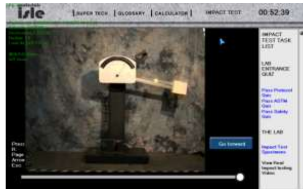
Figure 4 Actual high-speed video of Impact Test Machine, included in Materials-ISLE