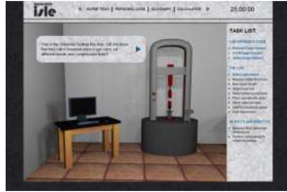
Figure 2 The Virtual Tensile Testing Machine