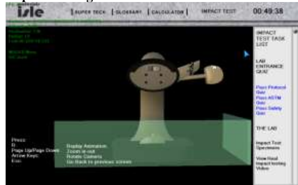
Figure 3 Safety screen to protect users during impact testing