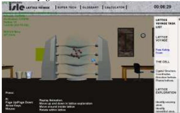
Figure 5 Virtual image of teleporter in the virtual lab environment