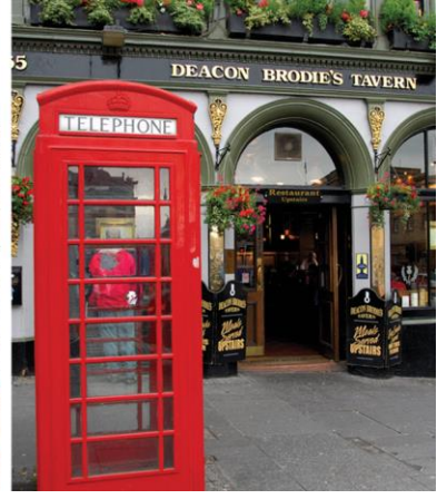
HIGHLIGHTS... London, Highclere Castle, London Theatre Performance, Cambridge, York, Edinburgh Castle, Lake District, North Wales, Stratford-upon-Avon, Cotswolds, Stonehenge

Day 1: Tuesday, August 12, 2014 Overnight Flight Feel the vibrant energy of England, hear the unique sounds of Scotland and see the rolling countryside of Wales on a trip that combines the exploration of dramatic history and natural wonders.